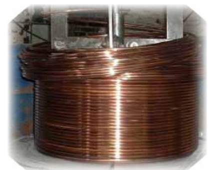
Copper theft poses safety, financial and reliability issues for electric utilities.

Linn County REC has increased security at our facilities and substations are inspected regularly. However, if you witness any suspicious activity around our property or equipment, please contact our office immediately at 377-1587 or toll free at 1-800-332-5420.