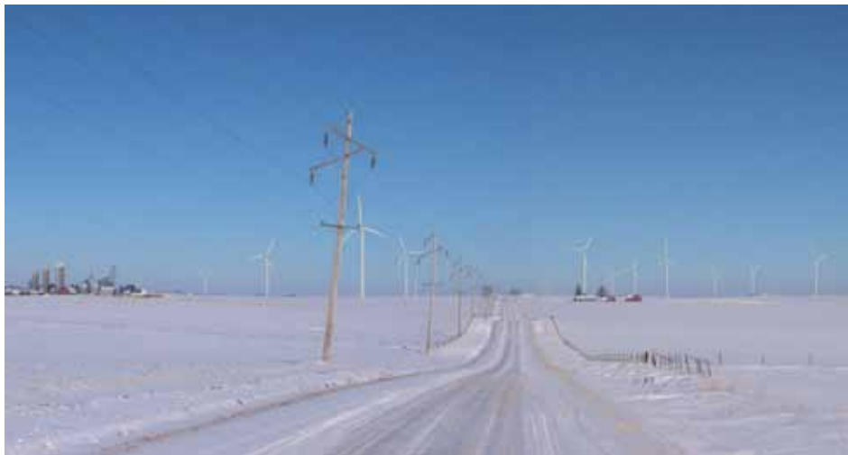
This is an artist rendering of the new Elk Wind Farm located in Delaware County.

The amount you pledge will be included with the monthly net amount on your Linn County REC bill. You may discontinue your pledge at any time by contacting our office at 377-1587 or toll free in Iowa at 1-800-332-5420.